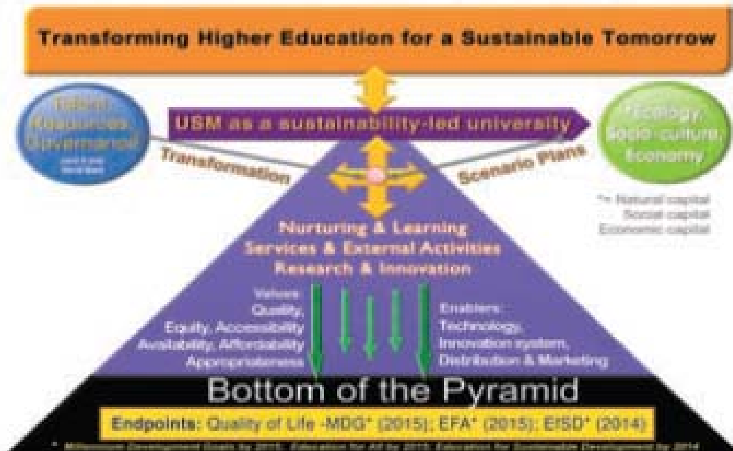
Figure 1: The USM's APEX university framework